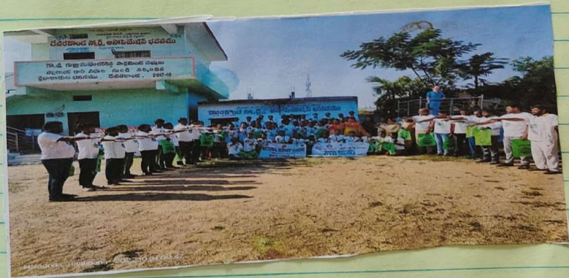
pledge to avoid plastic bags by Nss , NYK & DSA.