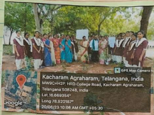
plantation by MPTC Korva Gouthami