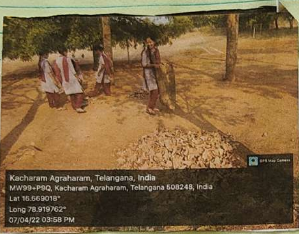
Healthy thursday cleaning the campus picking litter.