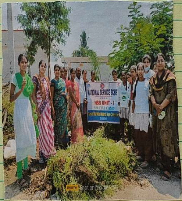
cleaning Bitchya nayaks thanda during special camp by Nss.