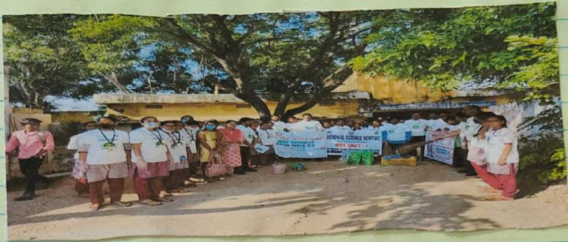
clean Andia Campaign in Devarakonda.