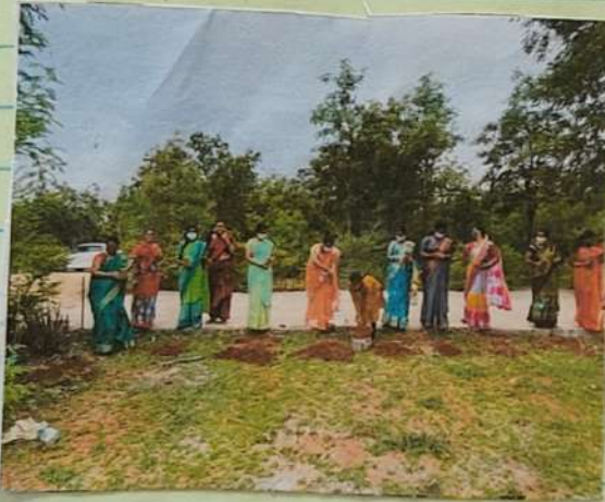
plantation by our staff